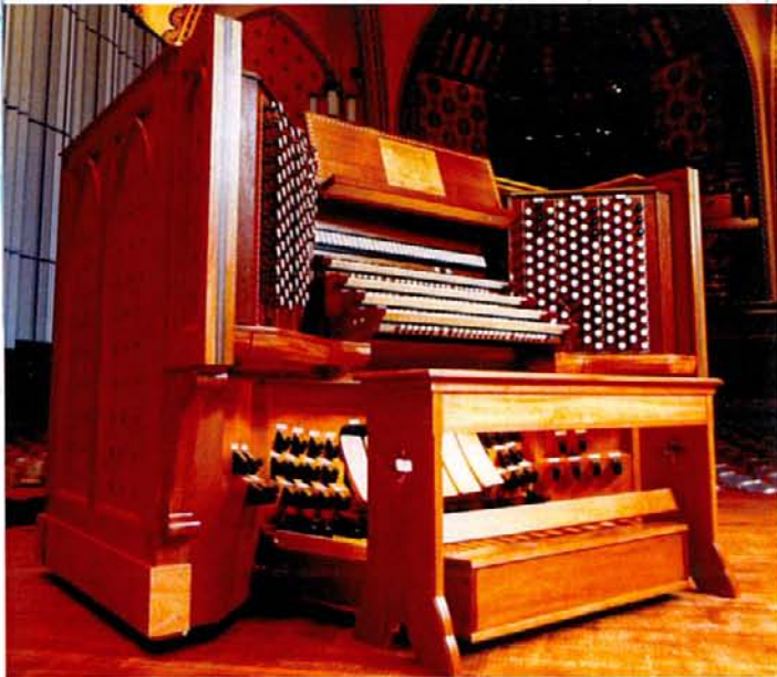
Austin Opus 1416 University of Pennsylvania, Irvine Auditorium 2002