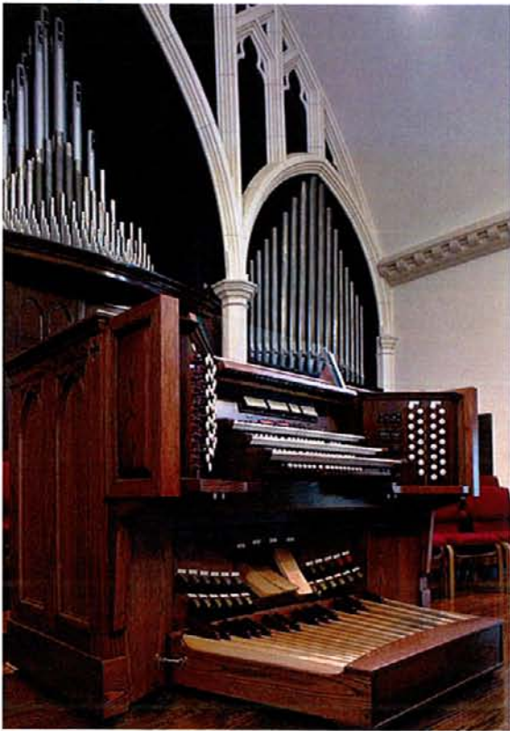
Austin Opus 2442 Highland Presbyterian Church, Louisville, Kentucky 2009