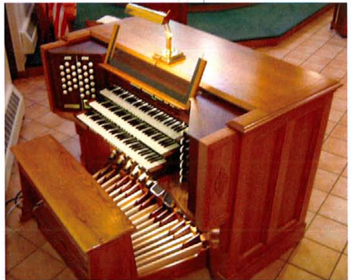
St. Lawrence Church, Killingworth, Connecticut 2010