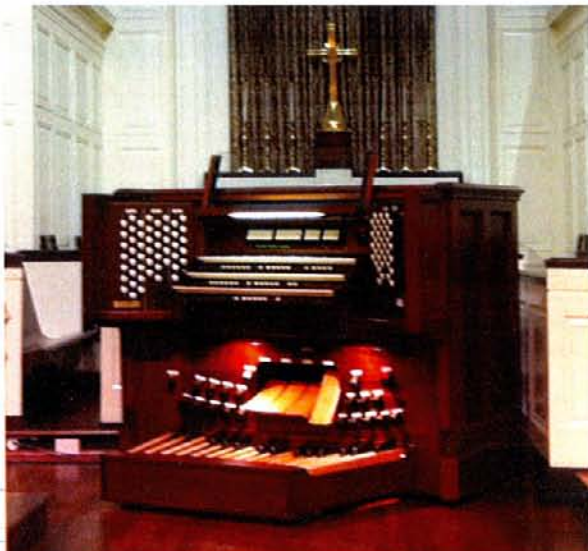
Austin Opus 2428 Buncombe Street Methodist Church, Greenville, South Carolina 2011