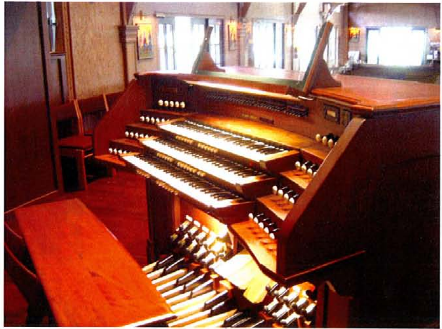
Austin Opus 2048 St. Clement's Church, Honolulu, Hawai'i 2010