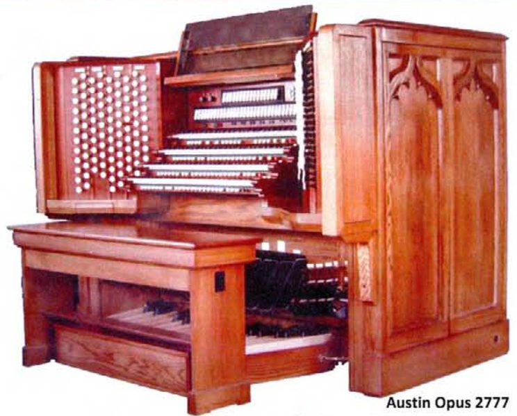
Austin Opus 2777 Bethesda-By-The-Sea, Palm Beach 2000