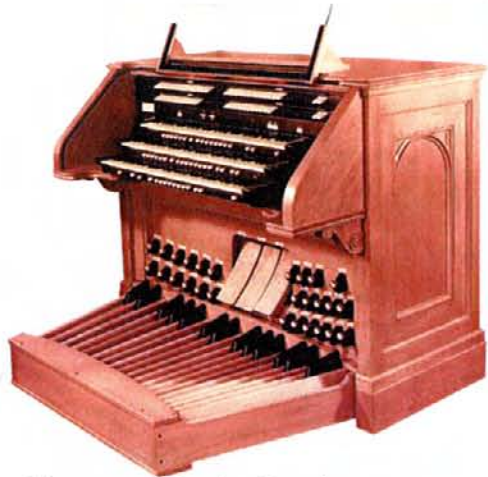
Three manual Stopkey Console