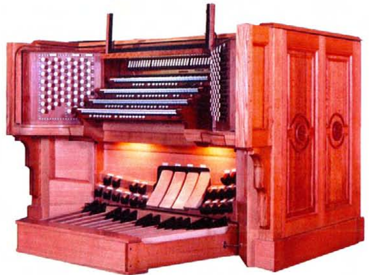
Smith College, Northampton Massachusetts 2003

An Austin Console is easily adapted to organs by many other builders.